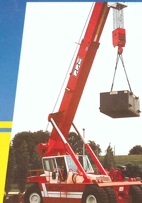
HOOK WITH WINCH